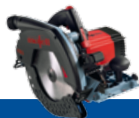
K 85 Ec

Favorably priced entry-level model Electronic, boxed