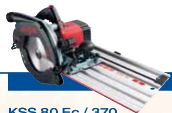
KSS 80 Ec / 370

Full-spec version in carrying case Electronic, variable speed, with parallel fence, in MAFELL L-MAX case