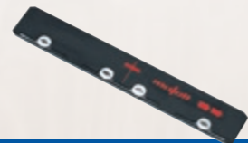
Connecting piece F-VS for joining two guide rails Order No. 204363