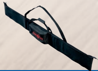
Guide pocket Guide pocket F 160 for guide rails up to 1.6 m long Order No. 204626