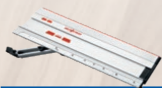
Angle fence F-WA Order No. 205357