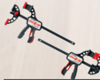
Lever clamp F-SZ 180MM 2 clamps, for fixing guide rail to workpiece Order No. 207770