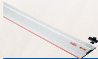
Guide rail LR Designation Length Order No. F 80-LR 0.80 m 207600 F 160-LR 1.60 m 207601