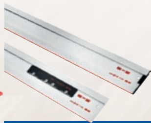
Guide rail F Designation Length Order No. F 80 0.80 m 204380 F 110 1.10 m 204381 F 160 1.60 m 204365 F 210 2.10 m 204382 F 310 3.10 m 204383