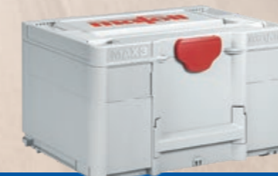
MAFELL MAX 3