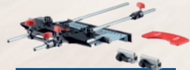
Adapter for hand router LO-FA Order No. 207200