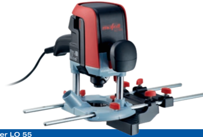
Hand router LO 55