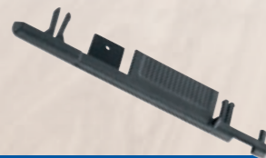
End caps F-EK 2 caps Order No. 205400