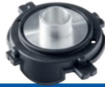
Template guide Ø 17 mm Order No. 209851