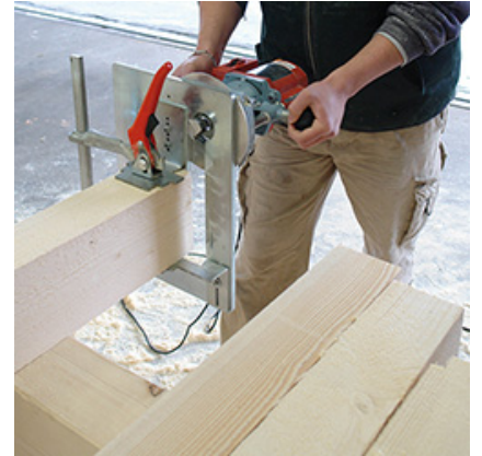
Speed: 8 to 18 mortise/tenon joints per hour.