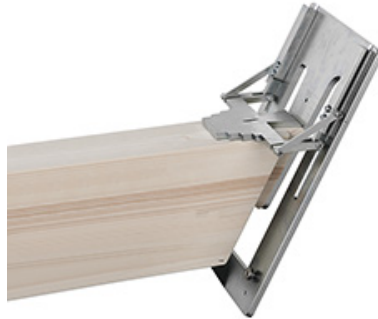
Perpendicular or angled joints on floor joists or rafter (roof system).