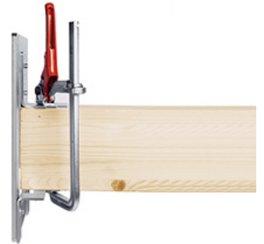
Perpendicular or angled joints on floor joists or rafter (roof system).