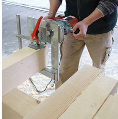
Speed: 8 to 18 mortise/tenon joints per hour.