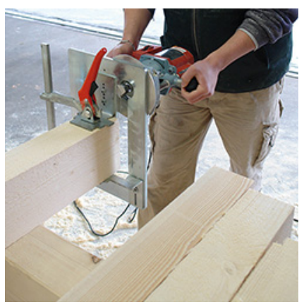
Speed: 8 to 18 mortise/tenon joints per hour.