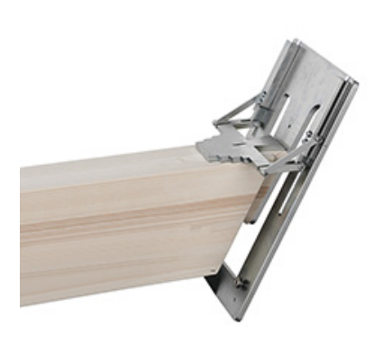
Perpendicular or angled joints on floor joists or rafter (roof system).