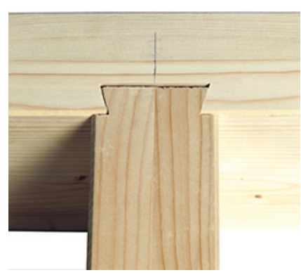
Dovetailed joints on floor joists or rafter (roof system).