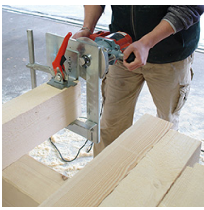
Speed: 8 to 18 mortise/tenon joints per hour.