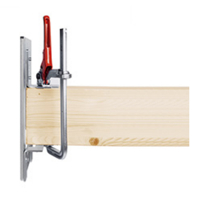
Perpendicular or angled joints on floor joists or rafter (roof system).